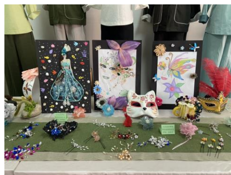
Static display: tea suits, tea accessories