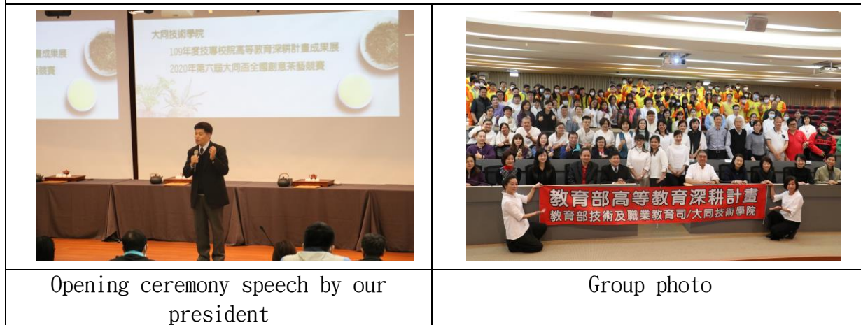
Opening ceremony speech by our president