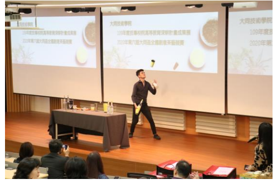
Opening ceremony: Flair Bartender Show