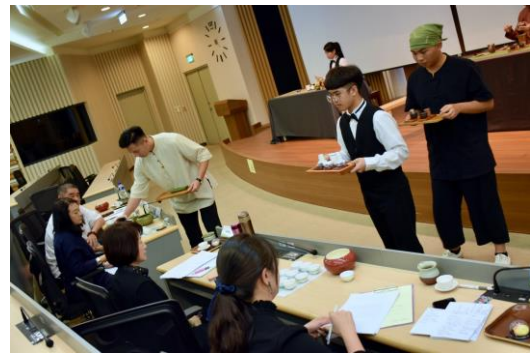
Tea Art Competition