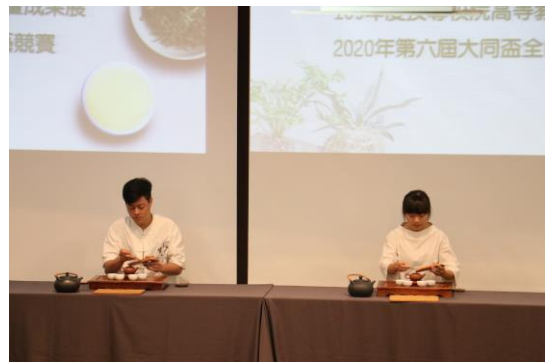
The opening ceremony