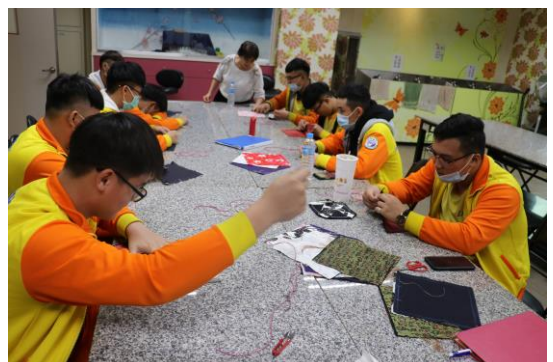
Dynamical experiencing course: DIY accessories