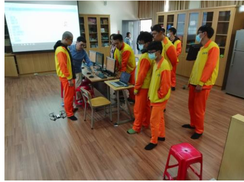
Dynamical experiencing course: Social work group activities