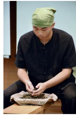
Tea Art Competition